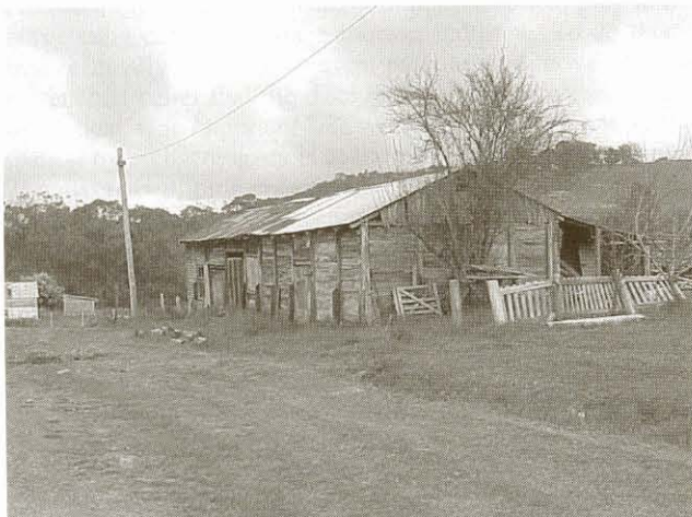
Figure 1. The Strathbogie Blacksmith's Shop.

Protected by its inclusion on the Victorian Heritage Register, this site provides a unique opportunity to examine the archaeology of the once ubiquitous stand-alone blacksmith shop that was a feature in most towns and villages. It has been possible to examine this site, with the building, tools and equipment still in place, and compare it with previous excavations of other stand-alone blacksmith shops. This has allowed us to consider the conclusions regarding the archaeological indicators found at these sites and how these indicators can be used to interpret sites in the future.