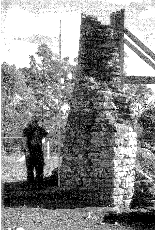
Figure 5. The remains of the convict-built windmill at Thomas Arndell's farm, now within Cattai National Park.

pasture and stock improvement, fencing and mechanisation have totally transformed the landscapes that remain.