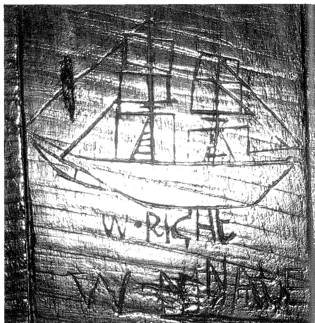
Figure 2. Ship and names inscribed into the wooden cell walls at Hartley Courthouse (D. Gojak).

Barracks were important throughout the convict period for marshalling larger numbers of convicts into readily controllable situations. The prime example still extant, and the subject of significant archaeological work, is the Hyde Park