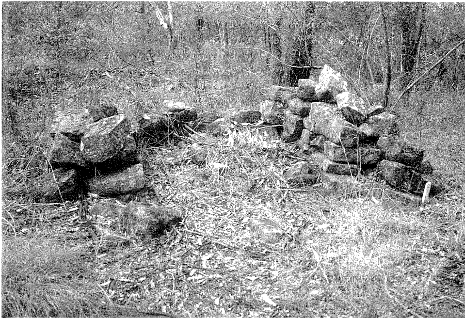
Figure 3. Convict accommodation structure, possibly a fireplace, at the presumed earlier stockade on the descent to Wisemans Ferry (D. Gojak).

individual rebellion and subversion that could survive the archaeological record.