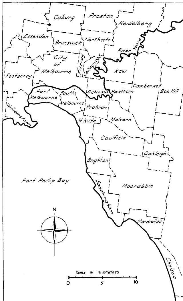
Fig. 1: Nineteenth century Melbourne and suburban municipalities (Barrett 1971:7).

Various methods have been used for the isolation of other variables. 18 Some tests involve the use of