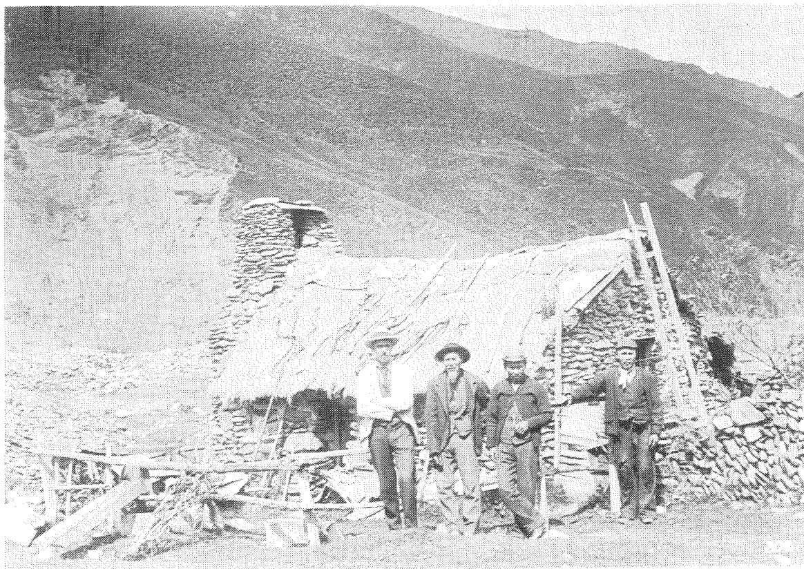
Fig. 3: Typical Chinese dwelling at Macetown (Arrow River), with the Reverend Don and occupants. Note peach tree at right of dwelling.

consuming sardines, bread, bottled fruits, pork and even the plebeian mutton chops, with Old Tom (brandy) to wash it down'. 45 Don listed mutton among a number of foods which were used by the Chinese miners. 46